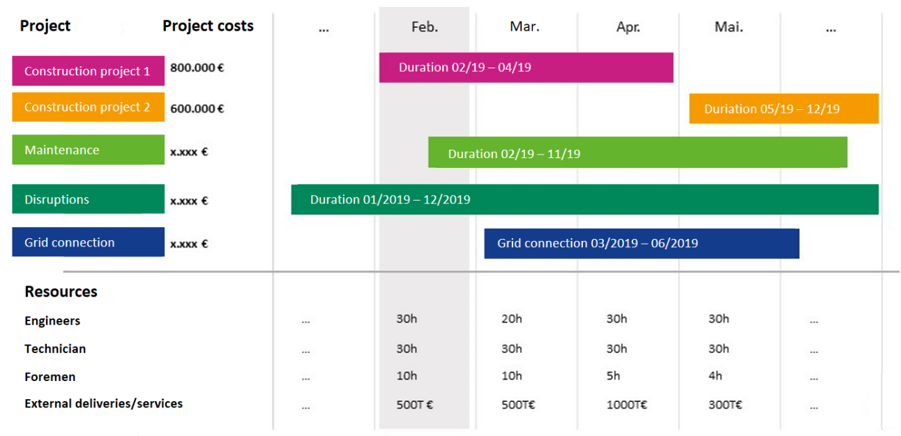
Figure 4: Exemplary representation of project and resource list