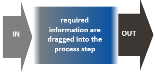
Figure 5: Pull principle

This process at MITNETZ completely covers the area of application of ISO 55001. The processes were developed according to the 'pull principle' (the following cycle determines the content and quality at the transfer point) to avoid waste (Figure 5)